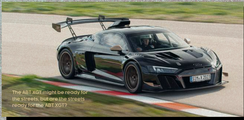
The ABT XGT might be ready for the streets, but are the streets ready for the ABT XGT?