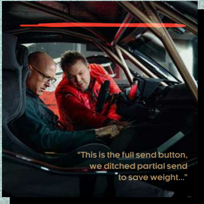
"This is the full send button, we ditched partial send to save weight..."