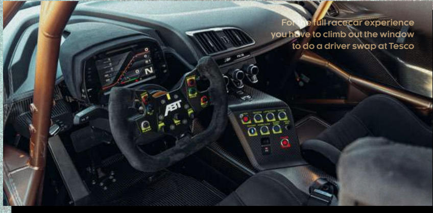
For the full racecar experience you have to climb out the window to do a driver swap at Tesco