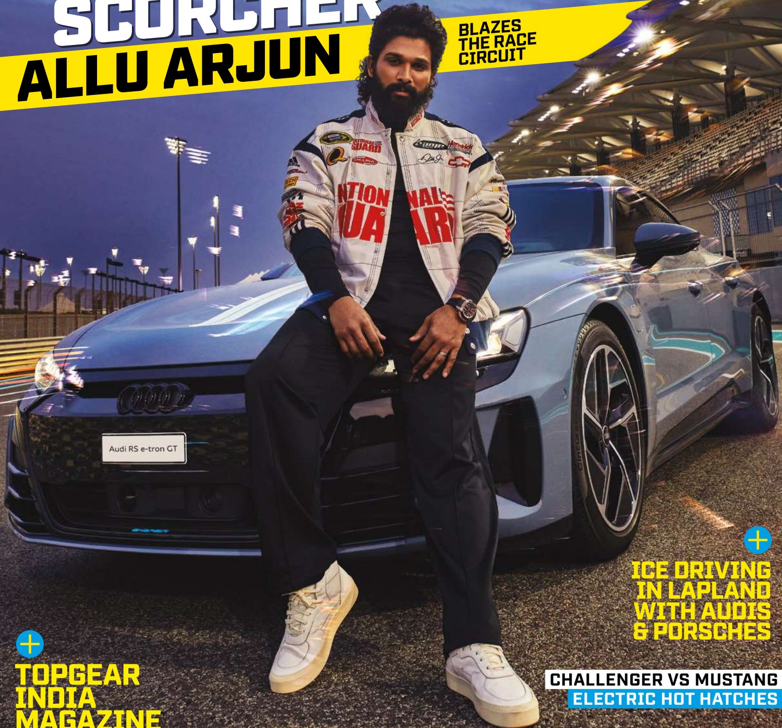
Audi RS e-tron GT